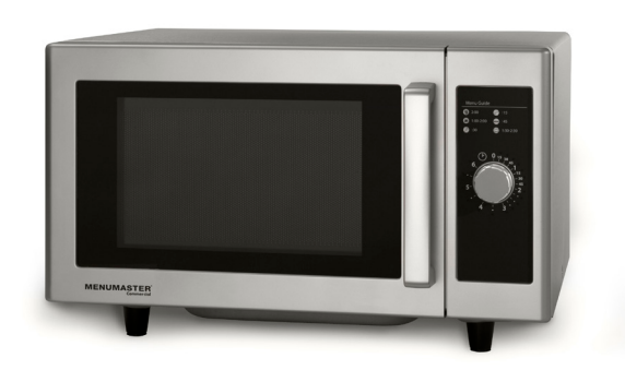
Model RMS510DS shown